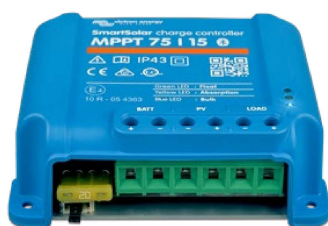
SmartSolar Charge Controller MPPT 75/15